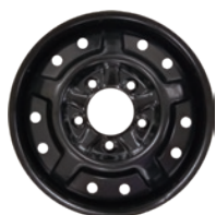
MSPN 49265 & 10545

Note: All UTV/ATVs use 60° / Conical / Tapered Lug Nuts.