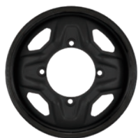
MSPN 75085 & 82599