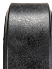
15" Smooth Polyresin Tread