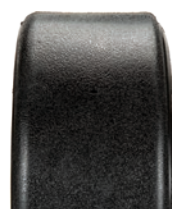
13" Smooth Polyresin Tread