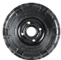
MSPN 68495, 67693, 65492, 64998 & 03488