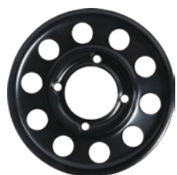
MSPN 21709 & 29242